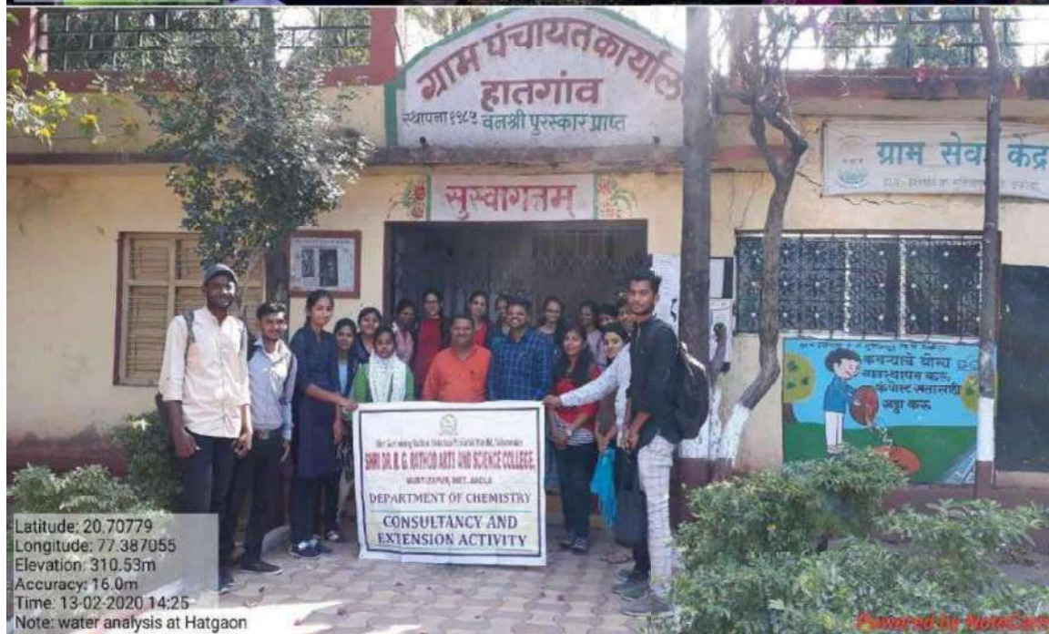
SOIL AND WATER ANALYSIS EXTENSION ACTIVITY AT- HADGAON 13-02-2020