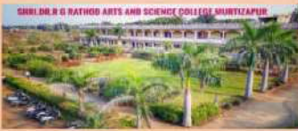
SHRI. DR. R. G. RATHOD ARTS AND SCIENCE COLLEGE MURTIZAPUR