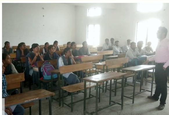
Placement Cell Activity